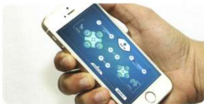
control the unit through "APP"