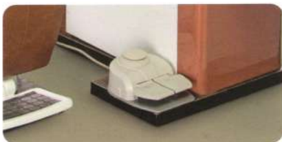
Multifunction footswitch (controls patient chair & phoropter arm)