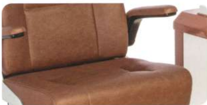
Luxurious leather finish