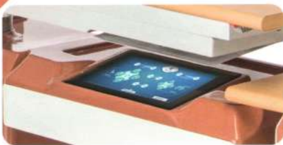
LED touch panel